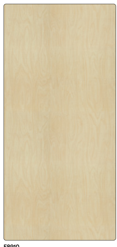
F8910 Raw Birchply