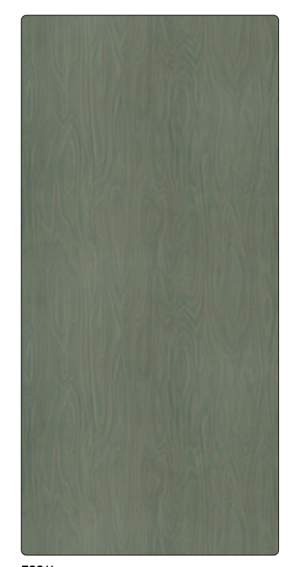
F8911 Green Slate Birchply