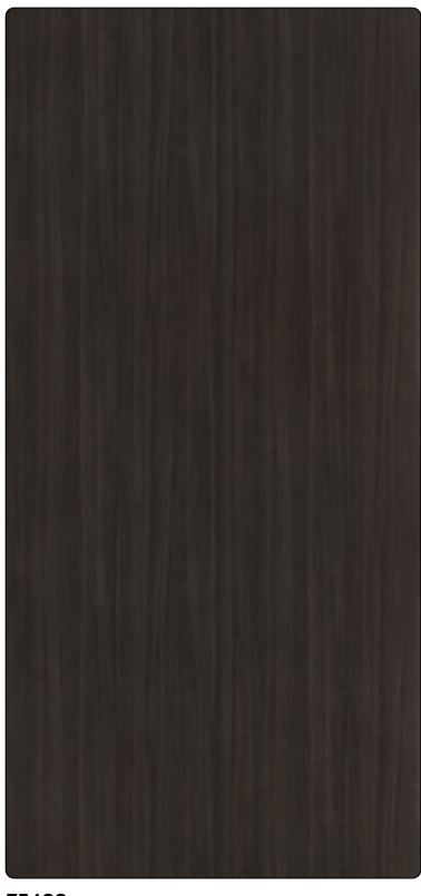
F5488 Smoky Brown Pear