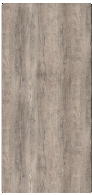
F6410 Weathered Beamwood