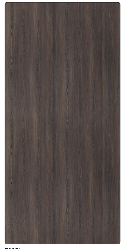
F8851 Classic Walnut