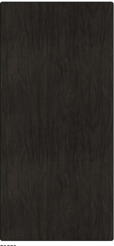
F8552 Black Birchply