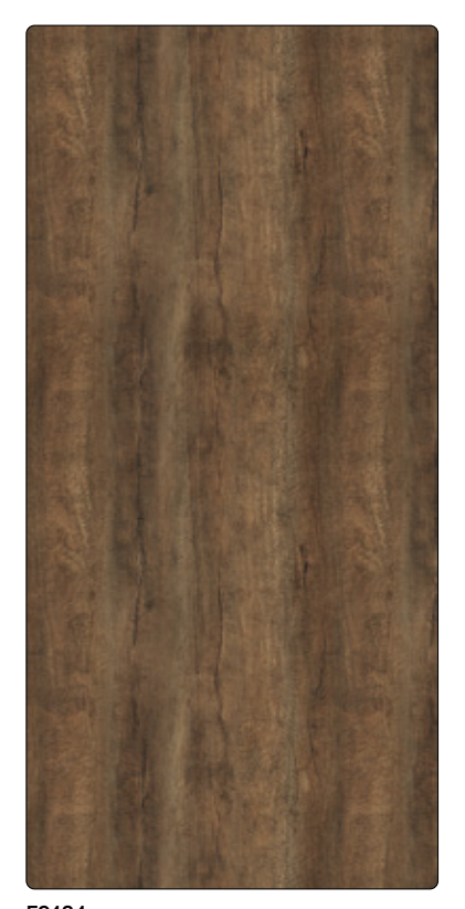
F9484 Oxidized Beamwood