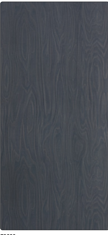
F9229 Dark Sky Birchply