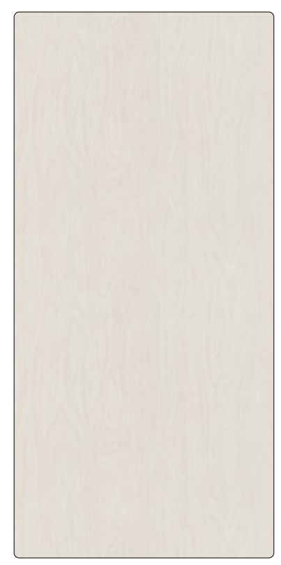
F6372 White Washed Birchply