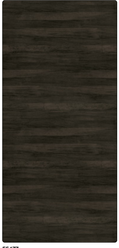
F5477 Ebony Oak Cross