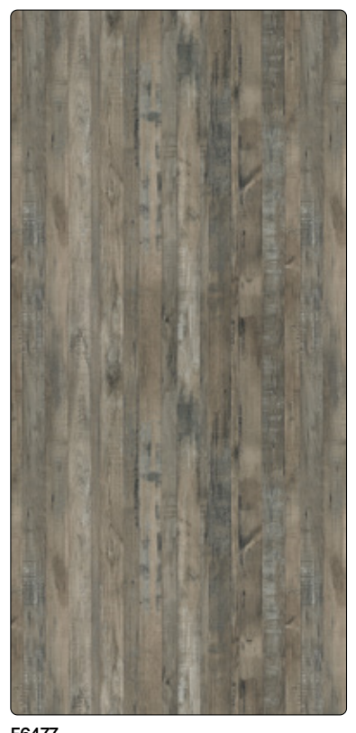
F6477 Seasoned Planked Elm