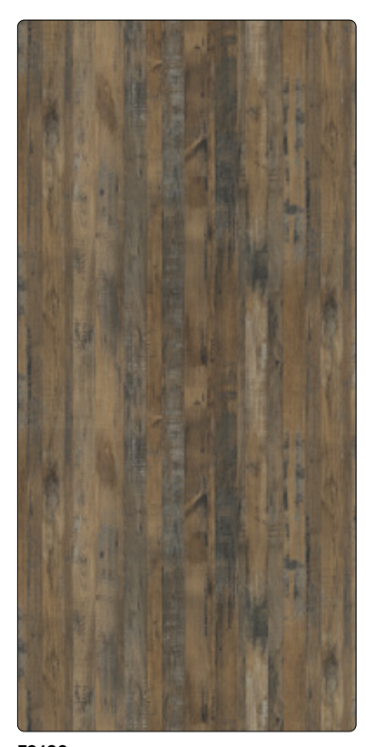
F9480 Salvage Planked Elm