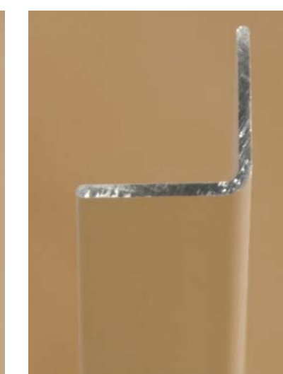
AT50 Corner Guard

ALL TRIM PROFILES ARE AVAILABLE IN FIVE ANODIZED COLORS: