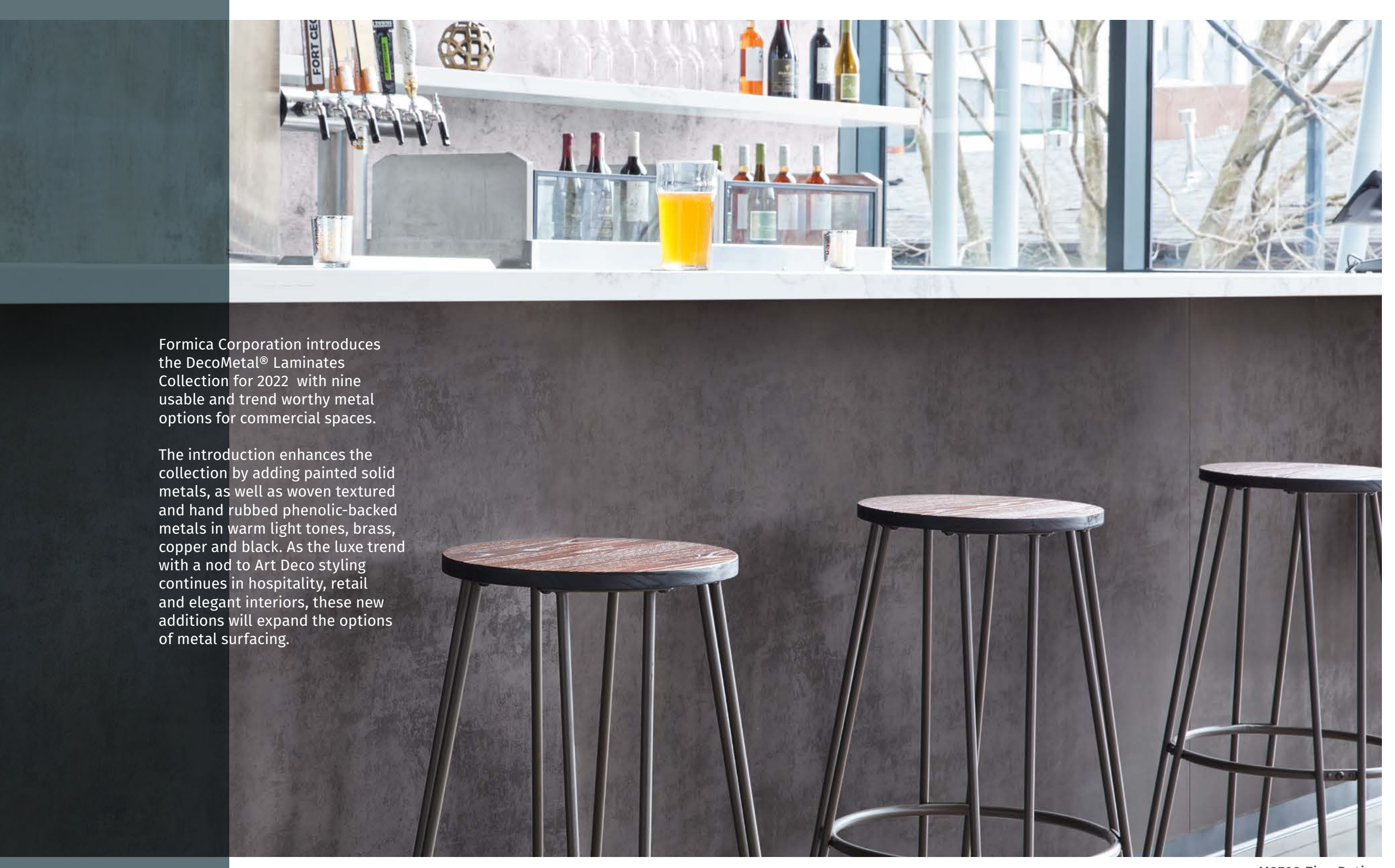
M3723 Zinc Patina