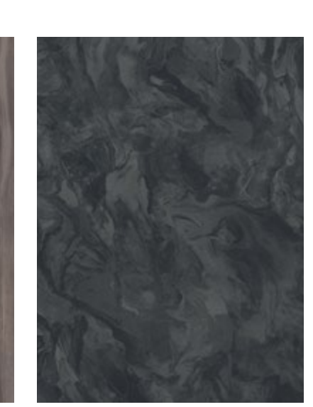
3702 Mediterranean Marble