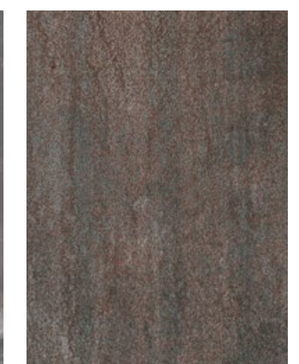
3708 Burnished Coin