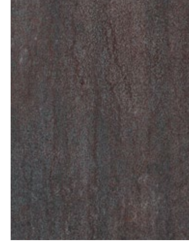
3709 Burnished Iron