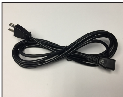
AC Power Cord in 6' or 10'