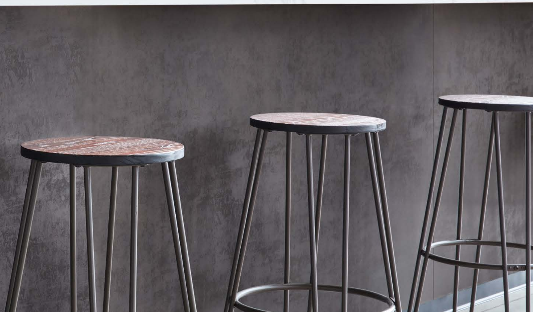
M3723 Zinc Patina

The introduction enhances the collection by adding painted solid metals, as well as woven textured and hand rubbed phenolic-backed metals in warm light tones, brass, copper and black. As the luxe trend with a nod to Art Deco styling continues in hospitality, retail and elegant interiors, these new additions will expand the options of metal surfacing.