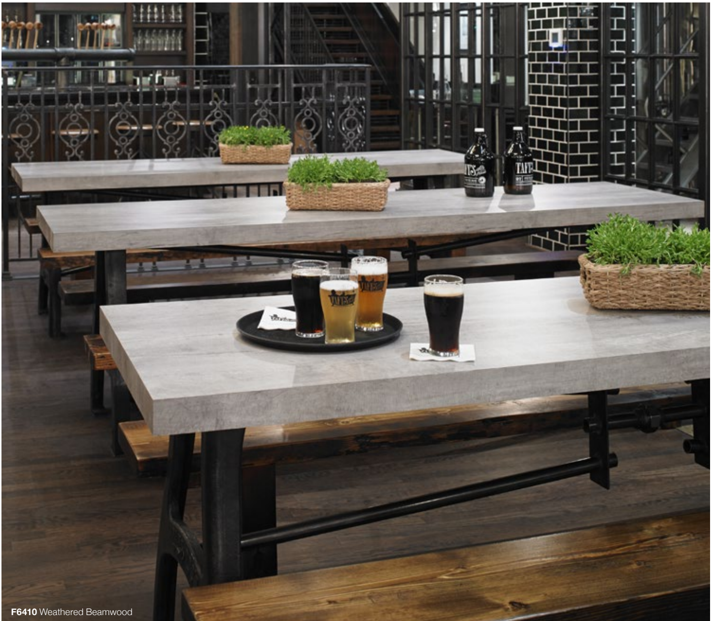
F6410 Weathered Beamwood

Add the finishing touches with custom surfaces in your hotel bar or restaurant through the Formica Door and Formica Washroom Collections . Enjoy woods, patterns and on-trend colours in both standard HPL and compact grade laminate.