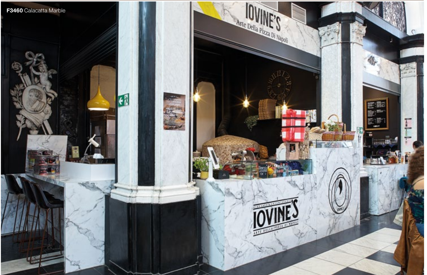
F3460 Calacatta Marble

Formica Laminate Calacatta Marble brings a contemporary look to the ground floor, drawing in light and contrasting superbly with the interior's black paintwork. Upstairs, Blue Storm integrates naturally with the transcendent design approach that powers the change into a landmark nightspot for both Ghent residents and international tourists.